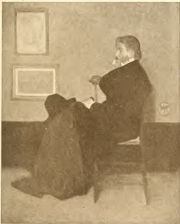
PORTRAIT OF CARLYLE.